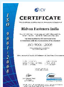
Ridvan Fasteners India