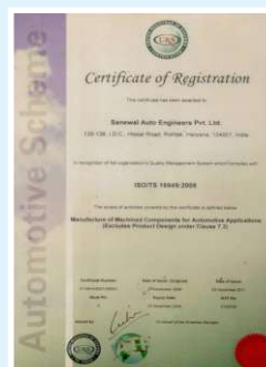
Sanawal Auto Engineers Pvt. Ltd.