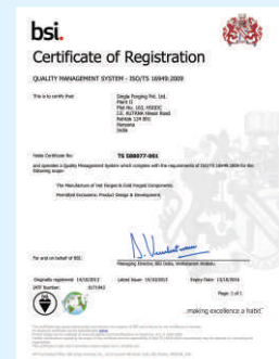
Singla Forging Pvt. Ltd.